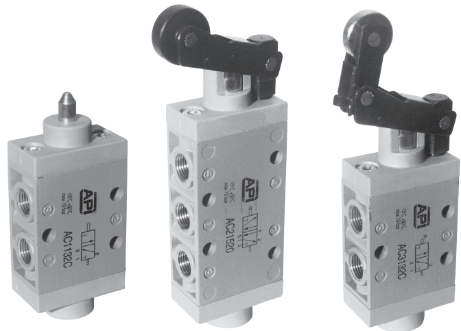
Series of spool valves mechanically operated (plunger, bi-directional and uni-directional lever)